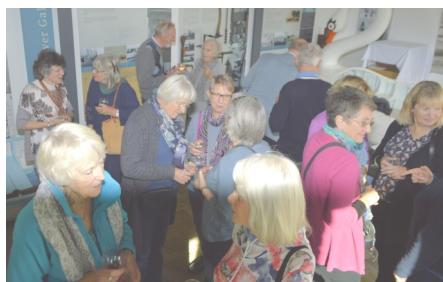
Volunteer Thank You Party - November

Meanwhile, conservation work is being carried out by our Collections team and Maintenance will be working on part of our building that can only be reached out of season. Inevitably, they will identify further work for subsequent years. Most of us do not even see these activities but their efforts are considerable and much appreciated.